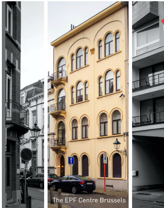
The EPF Centre Brussels