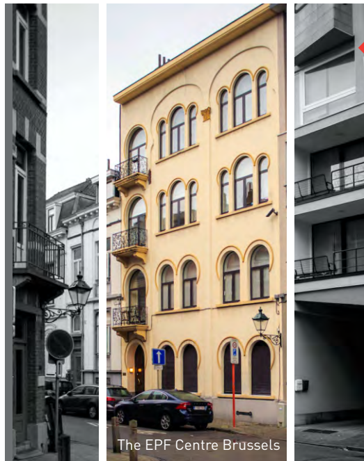
The EPF Centre Brussels